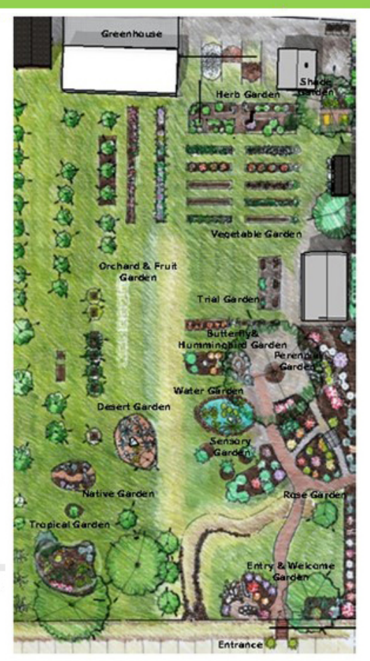
GARDEN MAP 1202 Genoa Red Bluff Road, Houston, Texas 77034